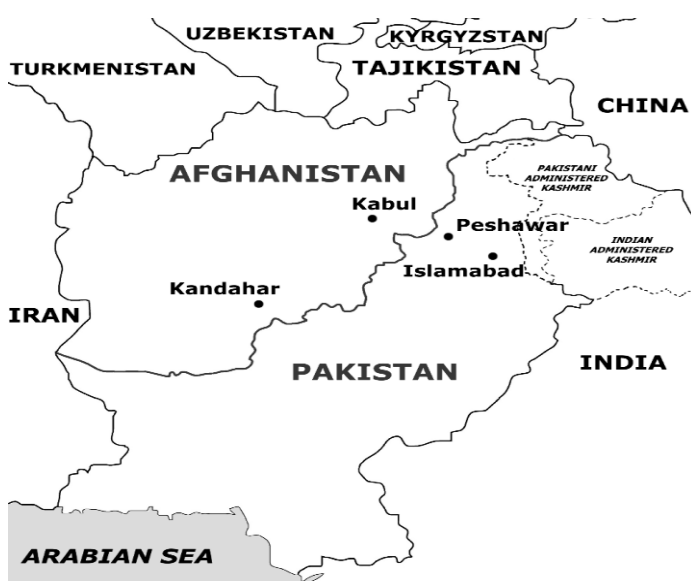
Figure 1: Map showing the geographic locations of key cities in Pakistan and Afghanistan, including Peshawar, Islamabad, Kabul, and Kandahar.

TBDs have a profound impact on public health. Lyme disease alone accounts for thousands of cases reported annually in the United States, with symptoms ranging from mild flu-like illness to severe complications affecting multiple systems including the nervous system, joints, and heart (6). Other TBDs exhibit varied clinical presentations and severities, adding to the complexity of diagnosis and treatment. The physical, emotional, and economic burdens these diseases impose on individuals and communities are considerable (7). Effective surveillance plays a critical role in the prevention and control of TBDs. Surveillance systems enable systematic collection, analysis, and interpretation of data regarding disease incidence, geographic distribution, temporal trends, and risk factors (7). This information is vital for identifying high-risk areas, detecting outbreaks, assessing control measures, and guiding public health interventions (8). Accurate and timely surveillance data enable public health officials and policymakers to allocate resources efficiently, design targeted prevention strategies, and educate healthcare providers and the public on the risks associated with TBDs (7, 8).